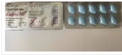
Leeforce 100 mg