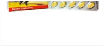
Tadalee 20 mg