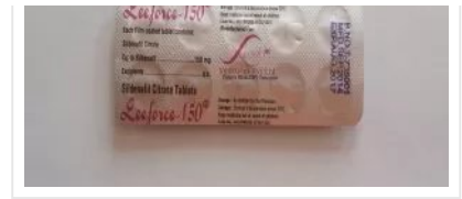
Leeforce 150 mg